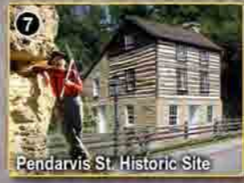
7 Pendarvis St. Historic Site www.wisconsinhistory.org 866-944-7483

Cave of the Mounds ® National Natural Landmark