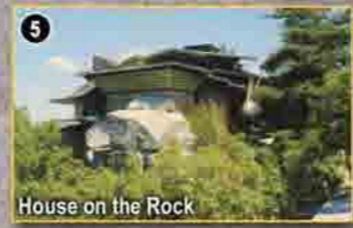
5 House on the Rock www.houseontherock.com 608-935-3639