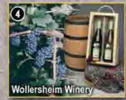
4 Wollersheim Winery www.wollersheim.com 800-VIP-WINE