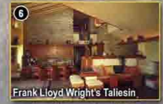
6 Frank Lloyd Wright's Taliesin www.taliesinpreservation.org 877-588-7900