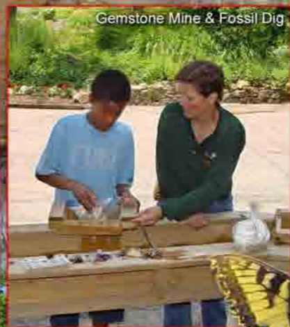
Gemstone Mine & Fossil Dig

Fill your pockets with treasure at our Gemstone Mine and Fossil Dig. All ages will delight as they discover their very own precious gems and authentic fossil specimens. Our staff loves to help guests identify their new found collections.