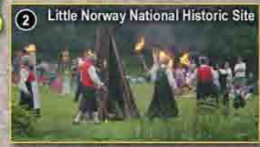
2 Little Norway National Historic Site www.littlenorway.com 608-437-8211